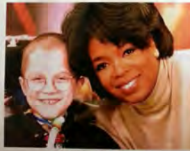
Mattie and Oprah